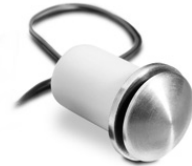
Button Sensor without Wall Plate